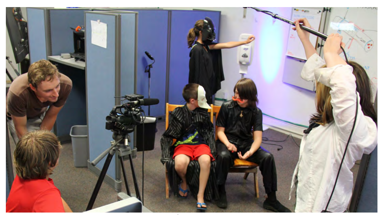
The crew captures a scene with Dr. McEvilface, Mustacharang and Darth Vader Junior. Somehow this makes sense in the movie!

This summer's week-long "Video & Tech Camp" featured 14 videomakers aged 9-13 creating their own commercials and PSAs, along with a short movie, while learning camera skills, video editing, audio, special effects, stop-motion animation and green screening – and this year added Minecraft as a video tool. They premiered "Digital Inferno: The Breakfast Club Assembles" before a packed house of parents and fans.