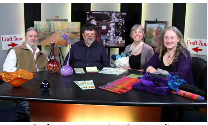
Putney Craft Tour artisans in BCTV's studio.

New England Youth Theatre Project Feed the Thousands