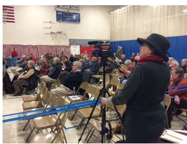
Debbie Lazar covers Town Meeting Day in Putney.